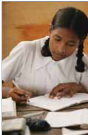
Rotary literacy projects have given a needed boost to Sri Lanka schools.

The magnitude of the problem is daunting. UNICEF estimates that one billion children and adults, approximately 15 percent of the world's population, lack basic literacy skills. According to the International Reading Association, which cooperates with many Rotary clubs worldwide on literacy projects, 113 million children in developing countries alone are not in school and not learning to read. And worldwide, approximately 500 million women are illiterate, making up two-thirds of the adult population that cannot read.