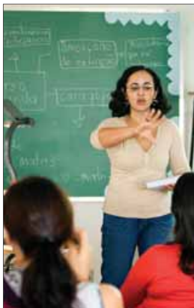
With support from Rotarians and The Rotary Foundation, more than 2,000 Brazilian teachers learned CLE.

Read a Web extra on developing Rotary literacy projects and find links to Community Assessment Tools (605C) and a fact sheet on Rotary and literacy.