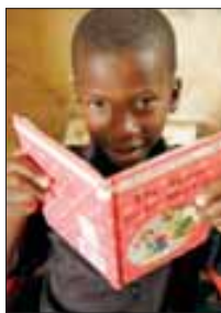
In South Africa, Rotary literacy programs touch people of all ages in rural and urban areas.

Difficulties with literacy can begin in early childhood. To help parents understand the importance of reading to their children from birth, the Rotary Club of Auburn, Alabama, USA, developed Babies Love Books. Through this project, the club works with a medical center that serves a low-income segment of the community to give children's books to parents of newborns.