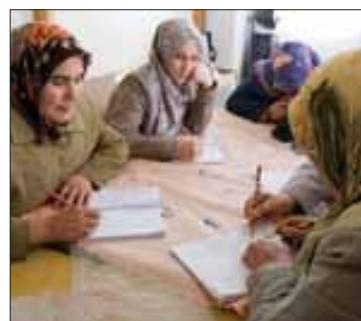
A Rotary-sponsored CLE program in Turkey focuses on teaching adult women basic literacy skills.

For the vocational training aspect of the project, students receive four months